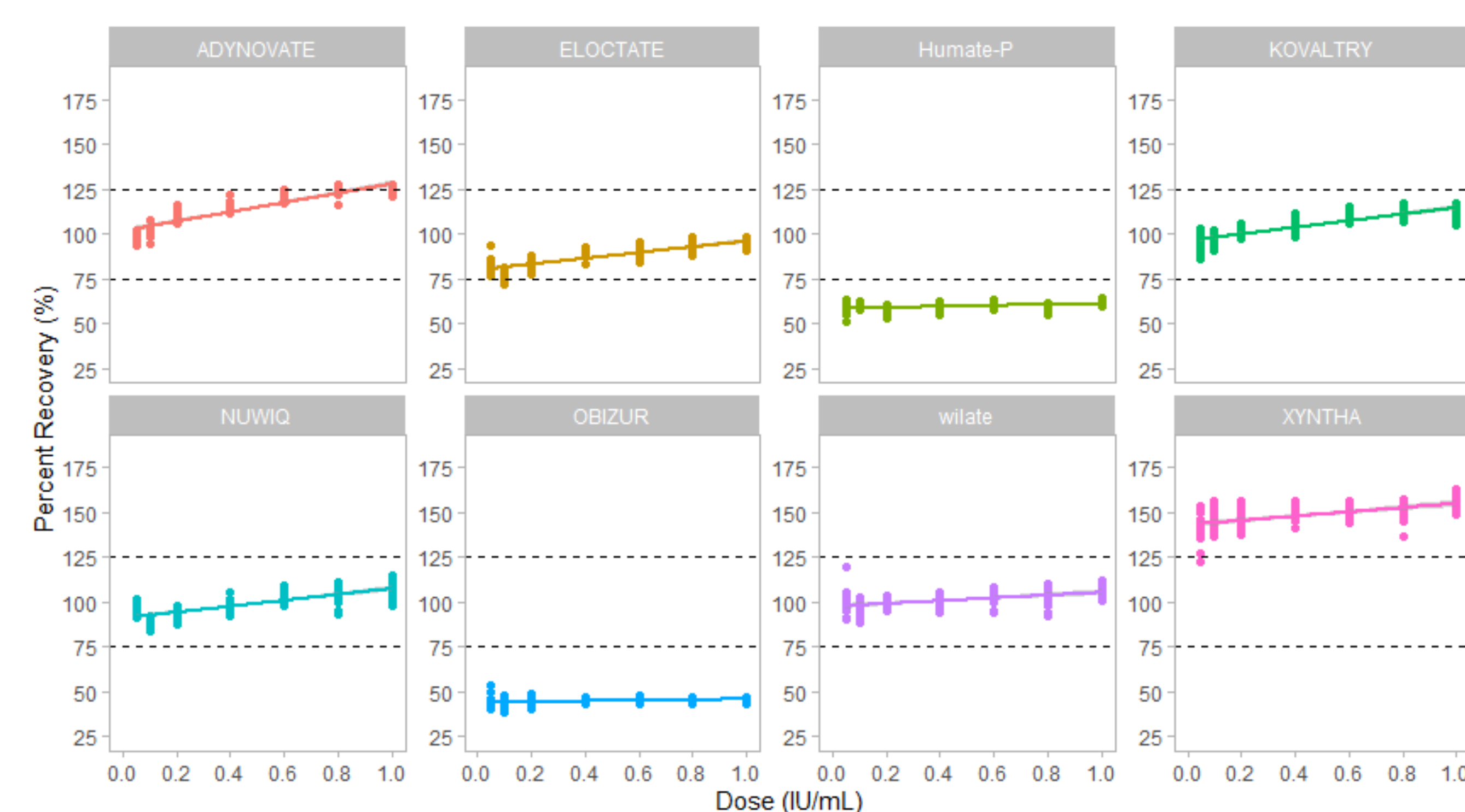
Percent recovery at target doses of 0.05, 0.1, 0.2, 0.4, 0.6, 0.8 and 1.0 IU/mL (N=15, 5 x 3 days) by cryocheck Chromogenic Factor VIII. The dashed lines indicate the acceptance criteria (±25% of the labeled activity).

Using acceptance criteria of 100 ± 25 percent recovery, cryocheck Chromogenic Factor VIII acceptably determined FVIII activity of 5/8 replacement products across all tested levels including ADYNOVATE, ELOCTATE, KOVALTRY, NUWIQ and wilate.